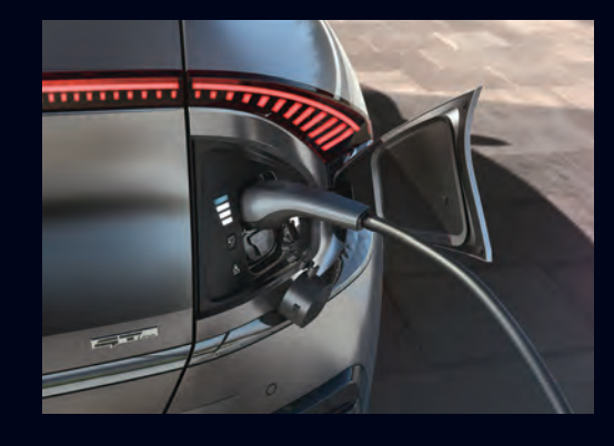
Ultra-fast Charging With 800V ultra high-speed charging capability, the Kia EV6 takes as little as 18 minutes* to charge from 10% to 80% 'With 350kW charger