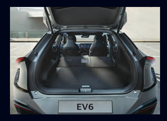
Remote Folding Seats

Pull the conveniently located remote release lever on the wall of the cargo space to fold the rear seatback down, creating 1,300 l <sup>**</sup> of storage capacity