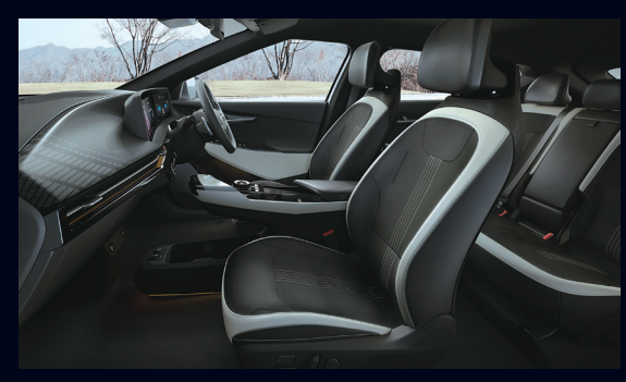
Black Interior - Black Suede Seats with Vegan Leather Bolsters