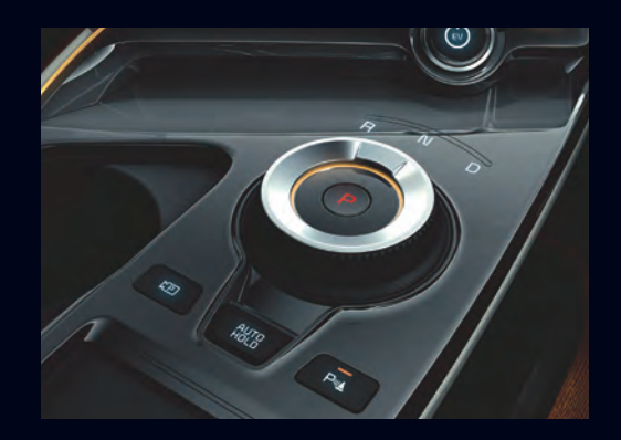
Shift By Wire Change gear position simply by turning the dial of Shift by Wire system left or right