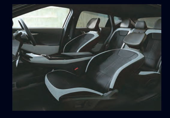
Driver and Passenger Relaxation Seats Front seats recline at the press of a button to a zero gravity position to give maximum relaxation to the occupant