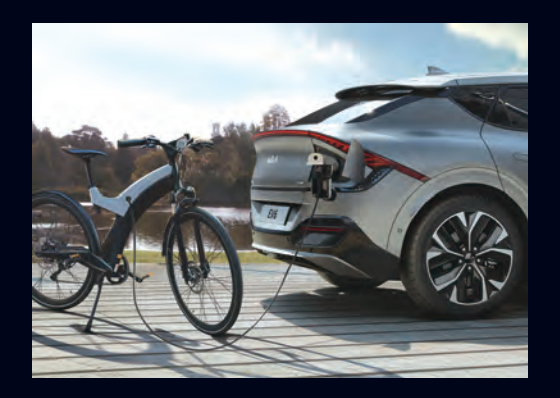
Vehicle-to-Load (V2L) Fully charged, EV6 offers 3.6 kW of power to run multiple devices inside and outside by attaching Vehicle-to-Load connector

Inspiration isn't just about having an idea. It's about giving life to that idea for the world to benefit from it. The EV6 is full of such ideas. Take its innovative charging technology for instance. It was conceived to not just take, but also to give. It employs a 2-way charging technology that turns it into a portable energy source capable of supplying current. Enough to power a medium size home AC. The 708 Km range<sup>#</sup> with a 77.4 kWh battery pack of Kia EV6 lets you explore more of what the world has to offer.