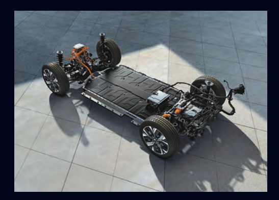
Electric Global Modular Platform (E-GMP) The New E-GMP platform introduces a flat floor, facilitating comfort and utility along with greater power, driving range and control