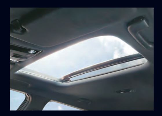
Wide Electric Sunroof The roomy dimensions of the Kia EV6 seem to expand with the wide sunroof

When you're inside the Kia EV6, not only do you appreciate how roomy it is, but also how inspiring it is. The upholstery makes use of sustainable suede and vegan leather while the cabin uses abundant recycled and durable materials. The New Electric-Global Modular Platform (E-GMP) allows for a flat floor which enables diverse interior layouts.