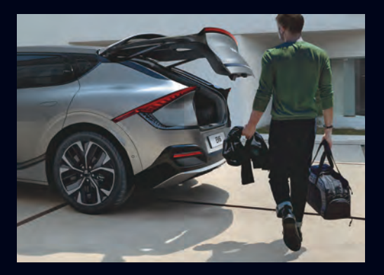
Smart Power Tailgate The power tailgate can be set to open automatically to a desired height

Augmented Reality Head-up Display Key information such as speed, lane safety indication, is projected in an intuitive manner on the windscreen